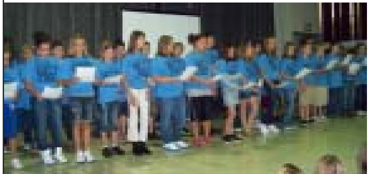
Sixth grade students sing the rap, “We Will Stop You.”