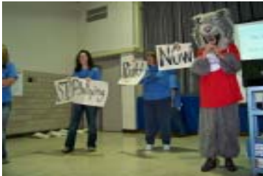
(right)The Wildcat leads cheers for the OLWEUS Kick-Off