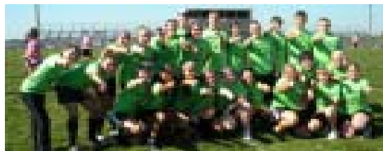
Seniors who participated in the Senior - Junior Powder Puff game, raising money to help those in need who are part of our Edison family.